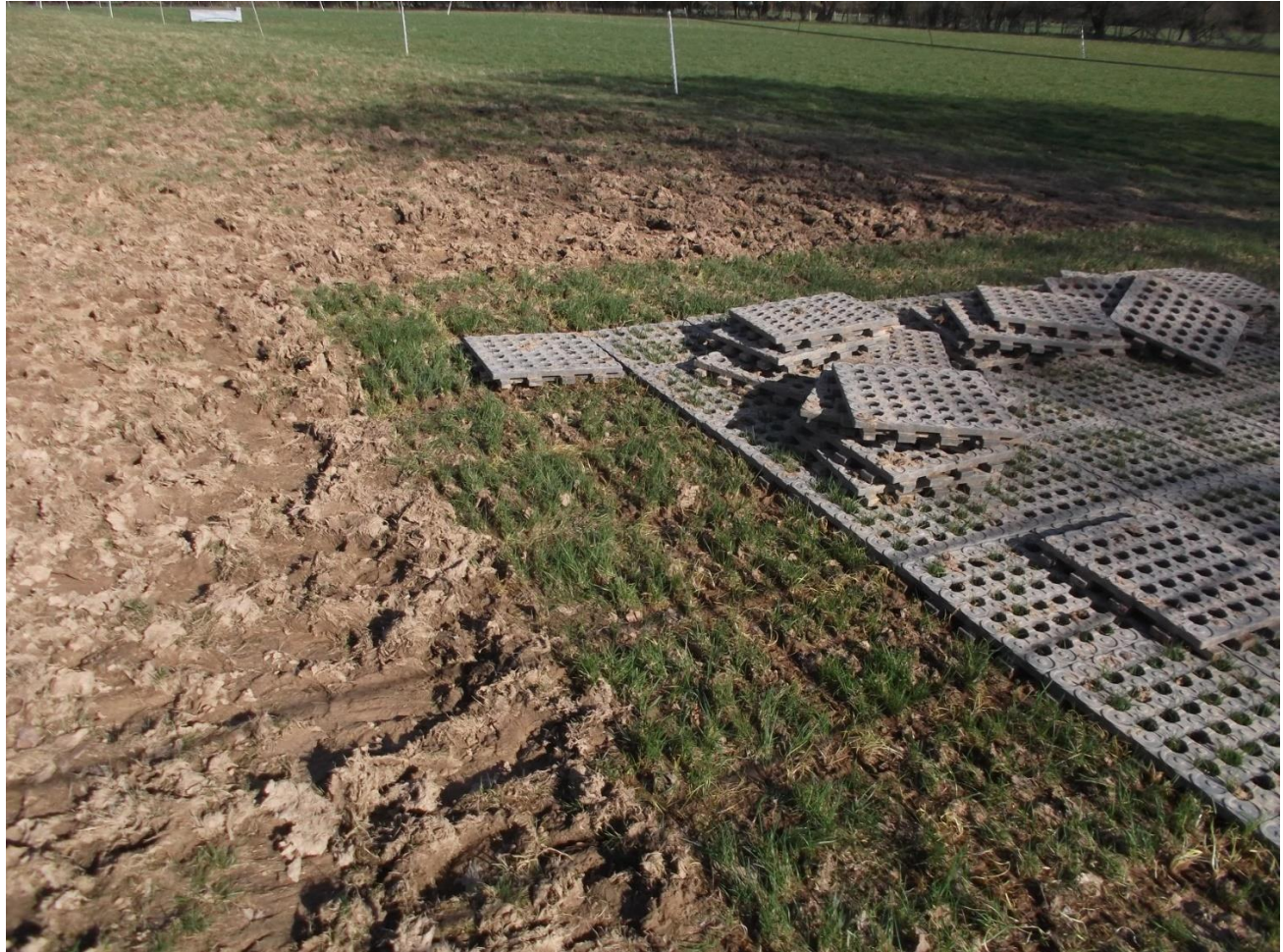
Add some grass seed and let MUD MATters heal the ground.