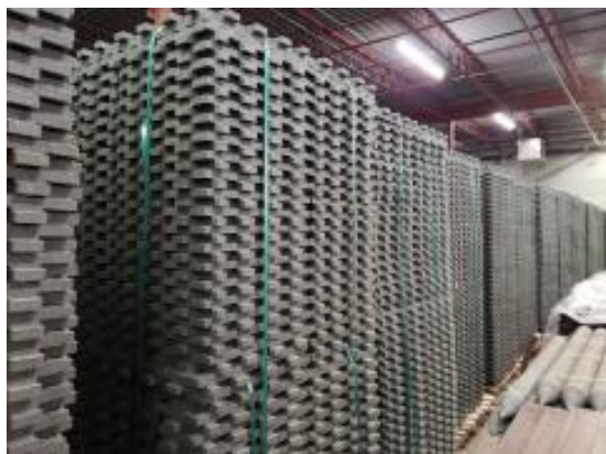
Inventory ready to ship.